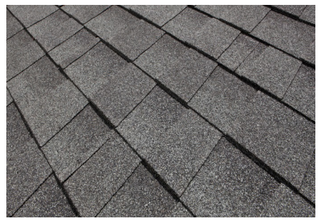
New, 0-5 years Little to no granular loss No cupping or curling Straight edges