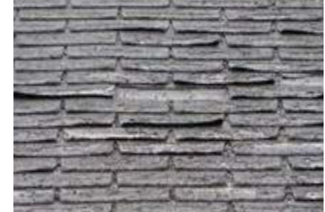
Heavy Wear, 15+ years Excessive granular loss Excessive cupping or curling Deformed edges