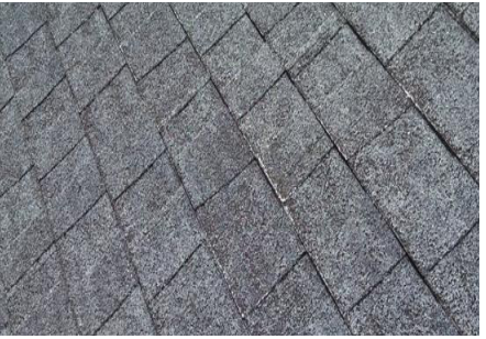
Medium Wear, 5-15 years Mild to moderate granular loss Some cupping or curling